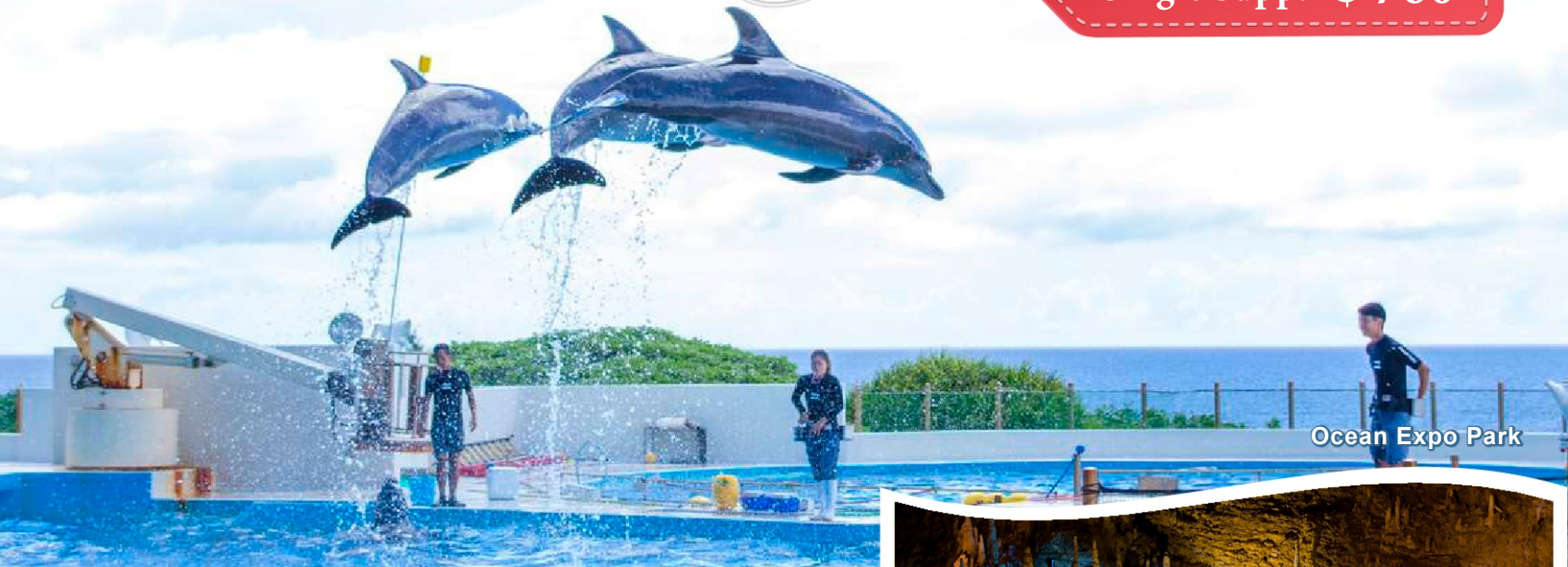
Ocean Expo Park