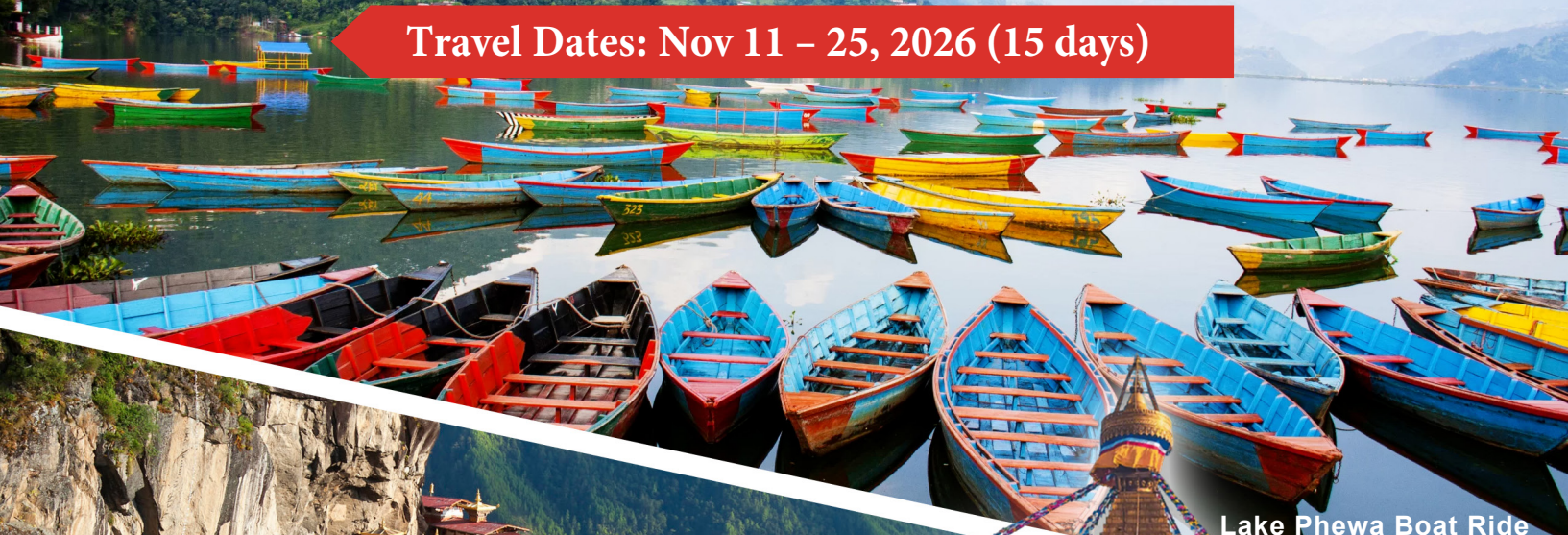
Lake Phewa Boat Ride

Travel Dates: Nov 11 – 25, 2026 (15 days)